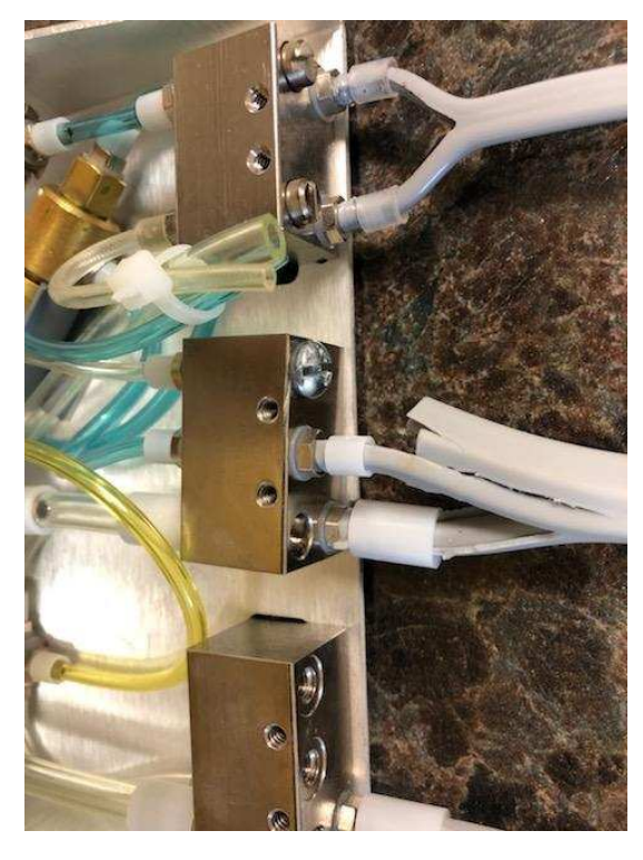
Small Control chip air blocked