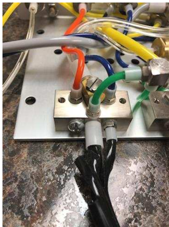
Large Control chip air blocked