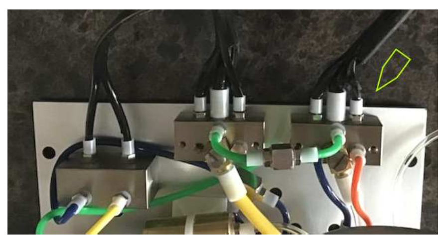
Large Chip Air